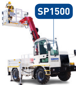
Basket Boom Truck