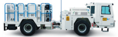
Fuel and Lube Truck