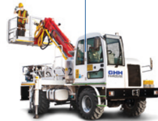
ANFO Charger Truck