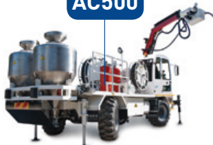
ANFO Charger Truck