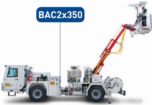
ANFO Charger Truck